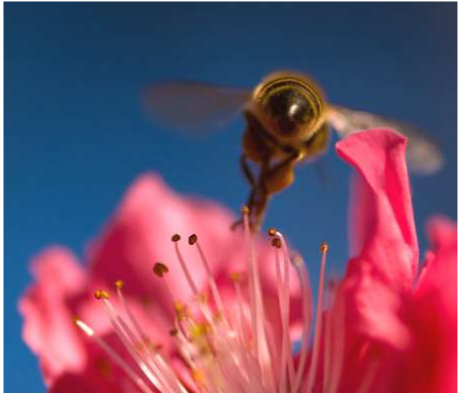
Bee & Flower