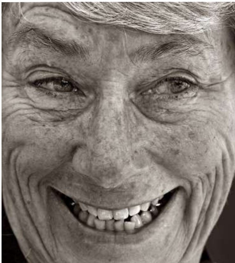
Karen by Brian Jones

Technical Details: F9 @ 1/100; 70-200 at 97mm; Canon 400D; RAW