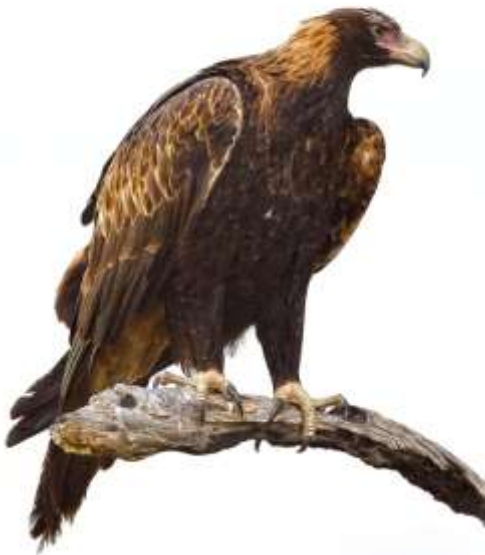
Wedgetail by Phil McFadden

Phil McFadden's image was also appreciated and he notes that, "I'd been trying to get this photo for about 6 months - carrying my telephoto lens everywhere I went. Finally got it on the west side of Mt Arawang, just as the eagle was about to take off. Photo was backed by white clouds. Canon 350D with 300mm lens at full zoom".