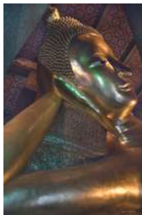
Handheld shot of a 15 x 45 metre gold plated Buddha at 800 ISO in a dark Bangkok temple.