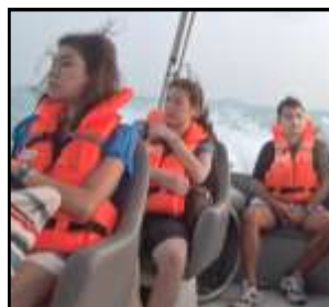
Rough and wet 30 knot boat ride but lens & body are fully weather sealed. I also have a hi-def video of this taken by the same gear.

and a big 2.8 lens strung around your neck, you start to wish there was another way.