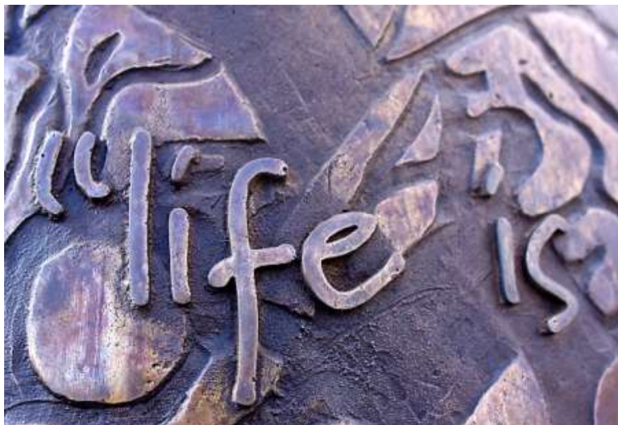
Life Is by Trish Grice

Trish Grice provided the following description of her image: “when I saw the sculpture with all the writing on it, the words ‘Life is’ caught my attention for the set topic of abstract. I thought it was abstract enough to fit the bill. I like the way the ‘is’ in the picture is out of focus as if the word itself suggests life dissolving into anything you want it to. I also liked the colours in the shot. Technical Details: f5.6 1/125 ISO 160”.