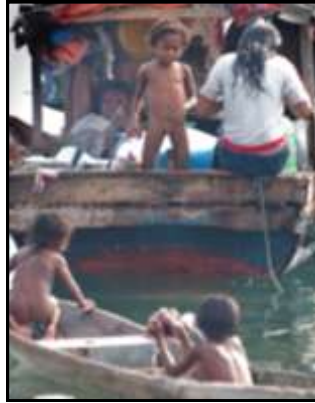
Handheld, 1/40th, effective focal length over 400mm, love that image stabilisation

On my trip it was a real pain lugging all this gear through airports and in and out of hotels. Fortunately, when you're out shooting your absorbed in the photographic process but after a day in the tropics with high end body