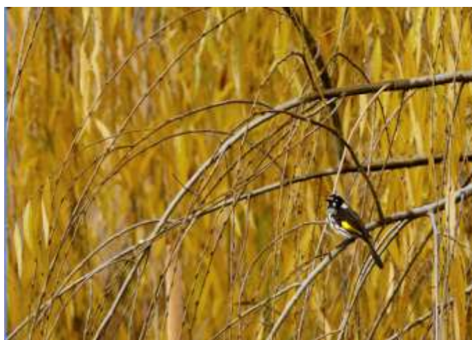
New Holland Honeyeater by Margaret Leggoe

Using Photoshop I selected the bright yellow on the bird's wing and then inverted the selection so that everything but the yellow on the bird's wing was selected. I then desaturated all the background yellow to allow the bird to stand out. A little bit of sharpening and cropping to pull the bird over to the corner,