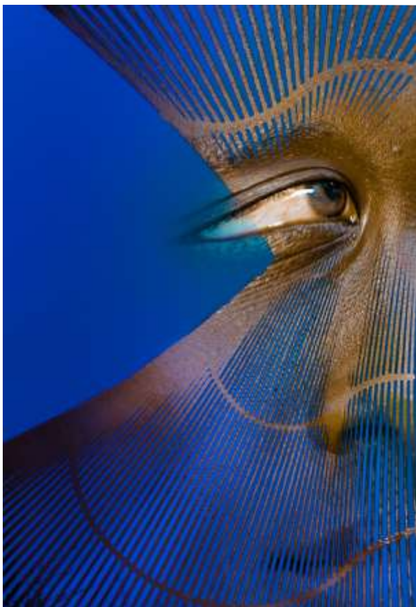
The Captured Eye by Russell Hunt

Russell Hunt notes that, "this image evolved as I experimented with combining a portrait with an extreme distortion of an architectural form.