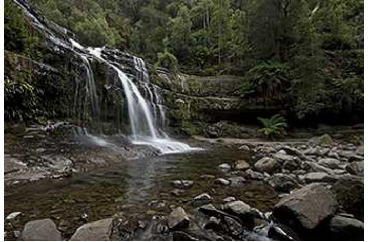
Liffey Falls