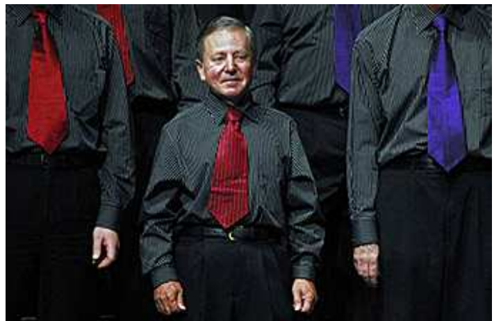
Strange Weather 30 by Brian Rope