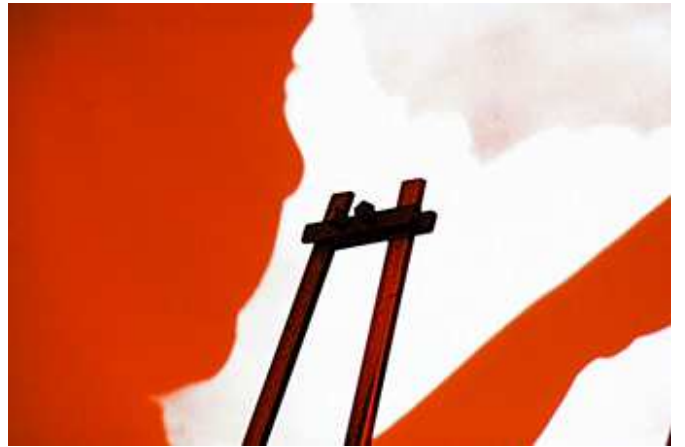
Easel Interruptus 3 by Brian Rope